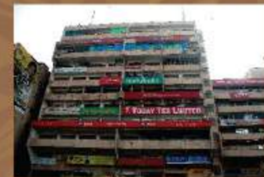
ROOTS TOWER (District Centre, Laxmi Nagar)

Expanding into other regions of North India