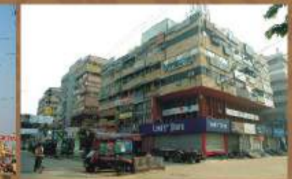
JOP PLAZA Sector-18, NOIDA

JOP is a recognized and well admired name in realty space with more than one hundred completed projects in its kit, and with thousands of satisfied and happy customers on its roll. Though the company has most of its residential and commercial projects in West Delhi, it has a wide presence in East Delhi, Noida and in other National Capital Regions as well. Some of its landmark projects are JOP Plaza, Noida, J.S Arcade, Noida and Roots Tower, East Delhi. JOP Square Mall is also coming up at Liberty Cinema in Rohtak.