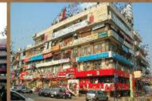
J.S ARCADE Sector-18, NOIDA